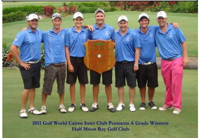
2011 Golf World Cairns Inter Club Pennants A Grade Winners Half Moon Bay Golf Club