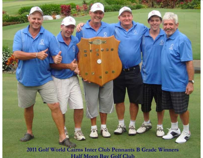
2011 Golf World Cairns Inter Club Pennants B Grade Winners Half Moon Bay Golf Club